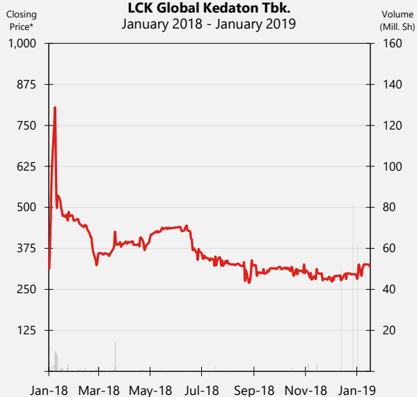
Closing Price* and Trading Volume LCK Global Kedaton Tbk. January 2018 - January 2019